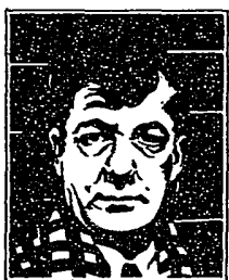
Sherwood Anderson Winesburg, Ohio—Vol. No. 104 Poor White—Vol. No. 115