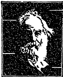
Walt Whitman Poems—Vol. No. 97