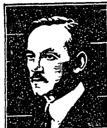
Eugene O'Neill The Moon of the Caribbees, and Six Other Plays of the Sea—Vol. No. 111