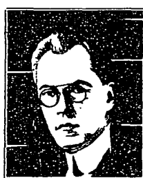
James Branch Cabell Beyond Life—Vol. No. 25 (In preparation) The Cream of the Jest—Vol. No. 126