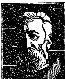
Anatole France The Queen Pedagogue—Vol. No. 110 Crime of Sylvestre Bonnard—Vol. No. 22 The Red Lily—Vol. No. 7 Thais—Vol. No. 67